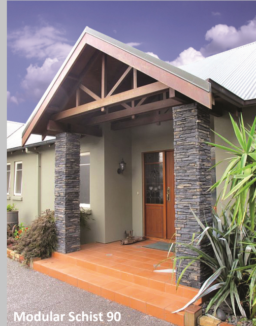
Modular Schist 90