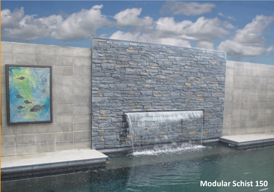
Modular Schist 150